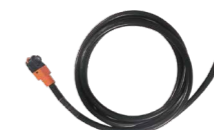
Negative Power Cable