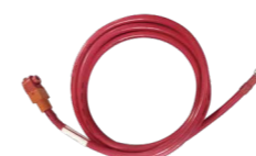
Positive Power Cable