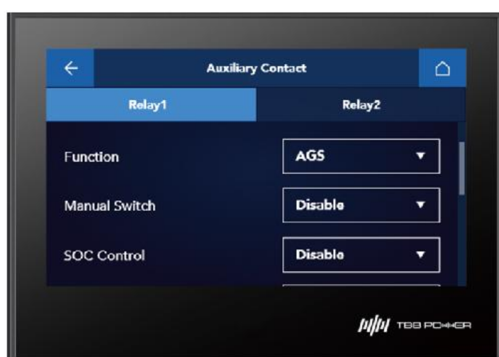
Generator AGS Control Setting