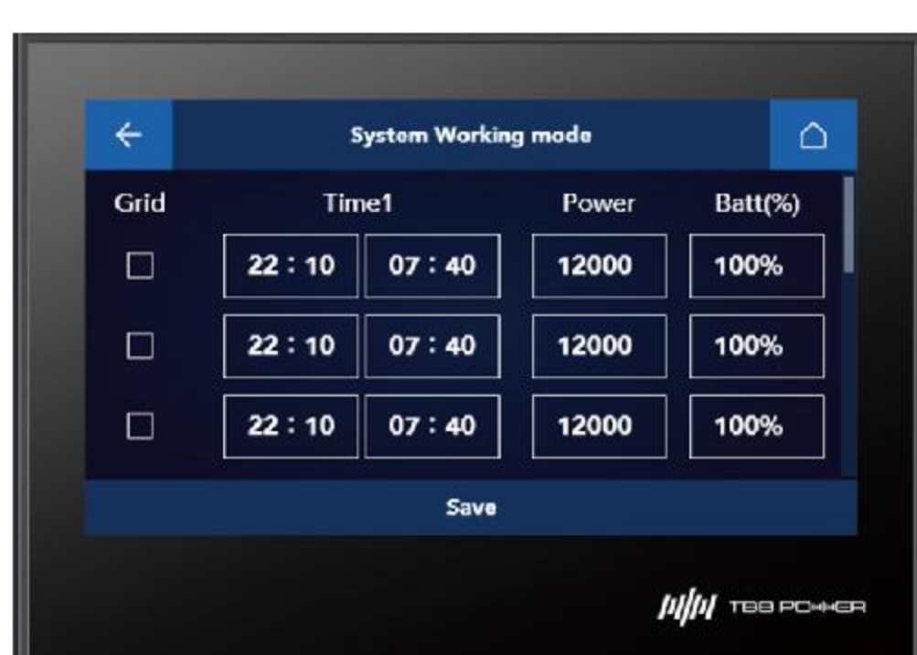
Time of Use: intelligent scheduling of energy from solar, battery, and grid/generator