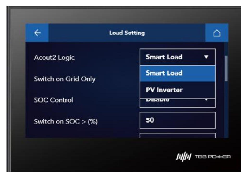
AC Out 2 for intelligent load control