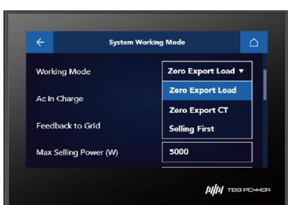
Working Mode Setting: Zero export to load, Zero export to CT and Selling first